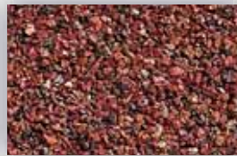
Terracotta (Tile Only)