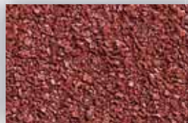
Garnet (Tile Only)