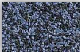
Arctic Blue (Tile Only)